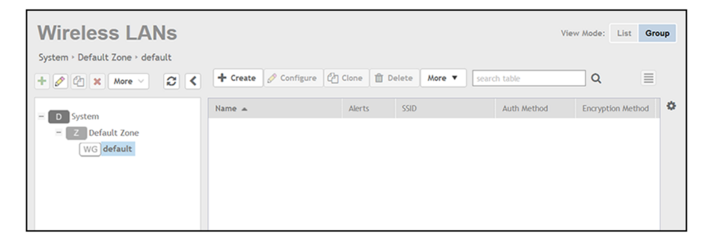
FIGURE 12 Wireless LANs Screen